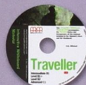
Interactive Whiteboard Material