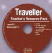
Teacher's Resource CD/CD-ROM